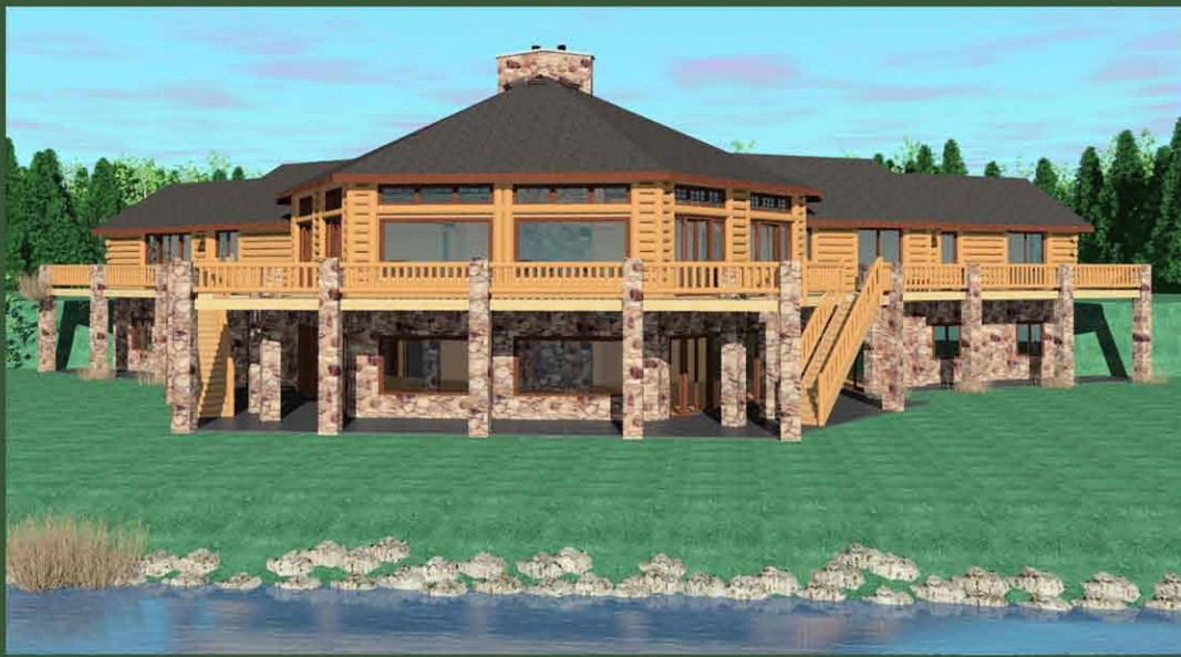
*Walkout Basement Is Optional Depending On Site